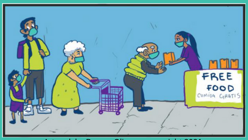
Artwork by Darren Olivares, copyright 2021.

Riverside County residents were asked if they had accessed any resources offered during the COVID-19 pandemic.