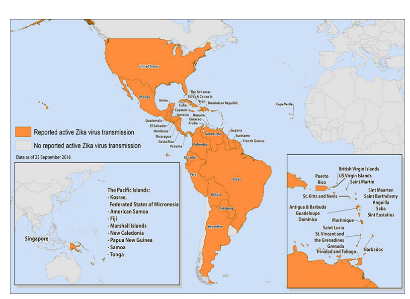
All Countries & Territories with Active Zika Virus Transmission; U.S. Centers for Disease Control and Prevention, November 2016

Since the emergence of Zika in Brazil in 2015, Zika virus has spread rapidly throughout Latin America and the Caribbean. Currently, Zika outbreaks are ongoing in 61 countries and territories, including in Mexico, where the highest numbers of cases are in the southern part of the country. However, the U.S. Centers for Disease Control and Prevention considers any travel to Mexico to be a risk for Zika infection. Individuals have been infected in popular tourist destinations including Cancun, Acapulco, Cabo San Lucas, Puerto Vallarta, Ixtapa, Mazatlan, and most recently, Ensenada, a coastal city in Baja Norte California. Local Zika virus transmission in Baja California Norte increases the risk that California residents