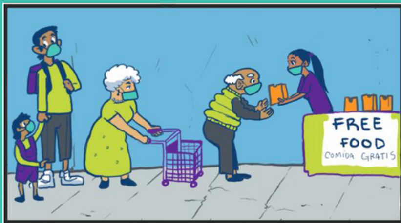
Artwork by Darren Olivares, copyright 2021.

Riverside County residents were asked if they had accessed any resources offered during the COVID-19 pandemic.